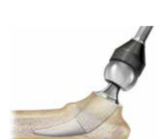
Femoral Head Impaction