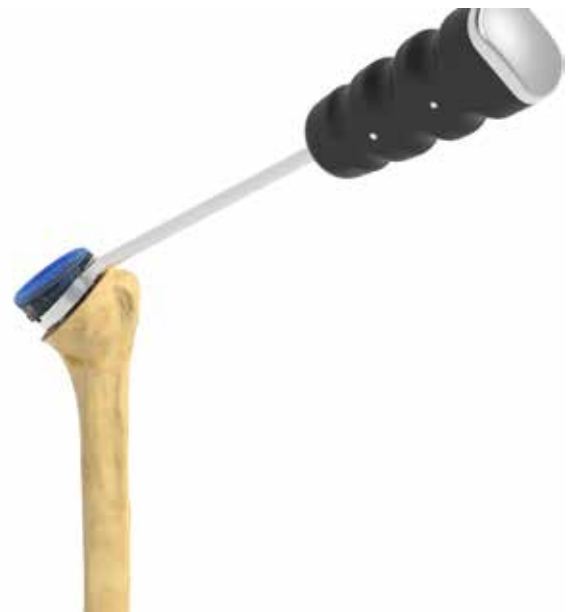
Figure 6 Sensor Removal