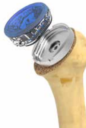
Figure 4 Sensor and Tray Trial Assembly

Open the box of the size of Sensor you wish to trial, leaving the sterile plastic packaging intact with the Sensor inside ( Figure 1 ).