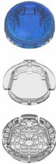
Figure 1 Sensor and Shim Components