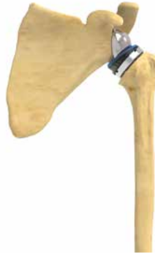
Figure 5 Joint Reduction

Finish the procedure per Equinox Platform Shoulder System Operative Technique 718-01-30.