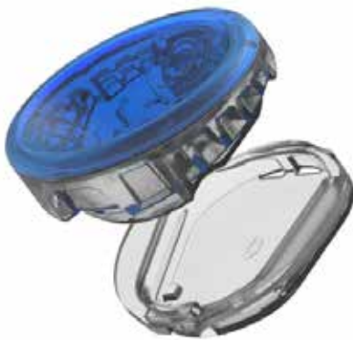
Figure 3 Sensor and Shim Assembly